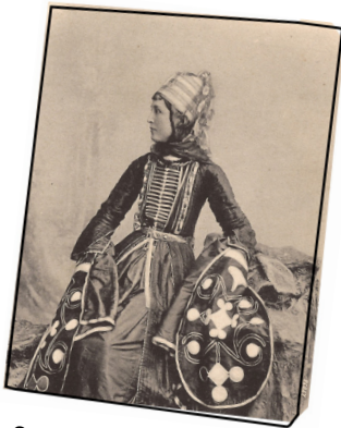
3. Wealthy woman